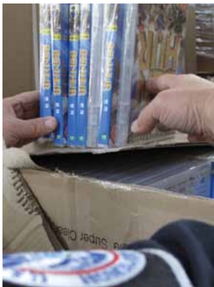
Counterfeit Optical Media