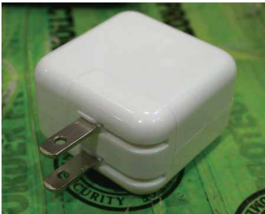
Counterfeit Electrical Component