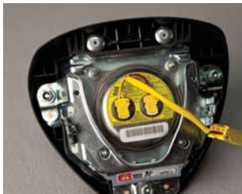
Counterfeit Air Bag

To conduct product identification training, direct your requests to the Assistant Port Director for Trade at each port of entry. A listing of field offices with contact information can be found at www.cbp.gov/ipr . Product identification training in respect of ITC exclusion orders must first be coordinated with the IPR and Restricted Merchandise Branch.